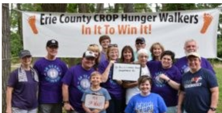
St. Paul's 2019 CROP Walk Team